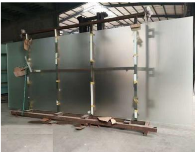
The technique of dip in acid liquid