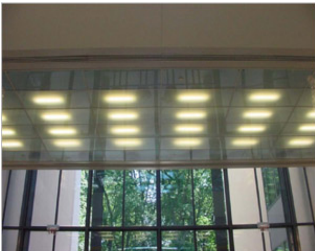
2mm acid etched glass for lamp