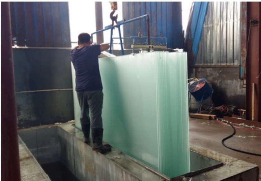
Made by machine technique